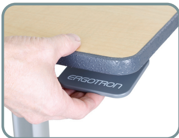
CHOOSE YOUR MOST COMFORTABLE WORKING HEIGHT WITH THE EASY-TO-REACH HANDLE.