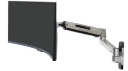
LX HD Sit-Stand Wall Mount LCD Arm