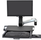
SV Combo Arm with Worksurface and Pan