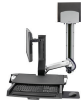
SV Combo Arm System with Worksurface and Pan (medium CPU holder)