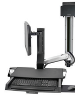
SV Combo Arm System with Worksurface and Pan (small CPU holder)