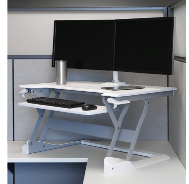
SHOWN WITH WORKFIT-TL SIT-STAND WORKSTATION

THE LOW-PROFILE MONITOR CROSS-BAR PROVIDES A COMPACT RANGE OF MOTION