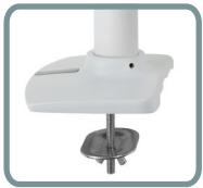
GROMMET MOUNT KIT ACCESSORY 98-034: ATTACHES THROUGH SURFACE HOLE