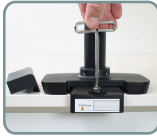
LOW PROFILE REQUIRES 0.78" (20 mm) CLEARANCE BEHIND THE DESK