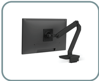
MXV Desk Arm, Low-Profile Top Mount C-Clamp 45-625-216 (white) 45-625-224 (matte black)