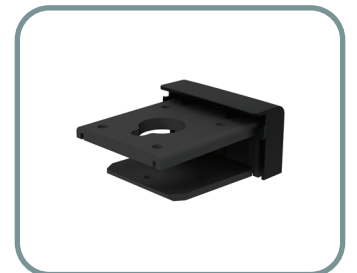
Low-Profile Top Mount C-Clamp, 0.71–0.98" (18–25 mm) 98-478-216 (white) 98-478-224 (matte black)

Download additional resources at ergotron.com .