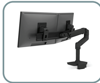
LX Dual Direct Arm, Low-Profile Top Mount C-Clamp 45-627-216 (white) 45-627-224 (matte black)