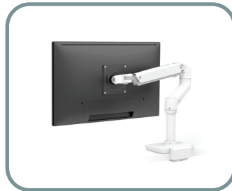
LX Desk Arm, Low-Profile Top Mount C-Clamp 45-626-216 (white) 45-626-224 (matte black)