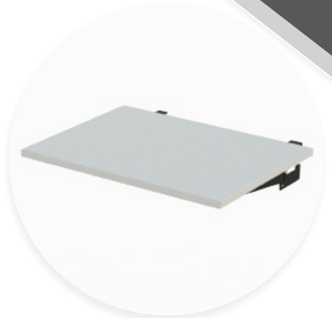
LAN STATION WOODEN SHELF

This Kendall Howard LAN Station shelf offers two instalation options. Install it at a level horizontal position or flip the brackets and install it with a 10 degree angle. Includes a metal lip to secure paperwork and devices in place.